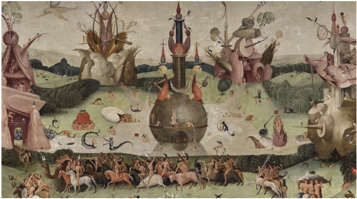
Contemporary follower of Hieronymus Bosch, The Garden of Earthly Delights , circa 1515 (detail)